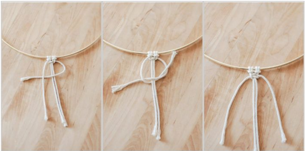
Right cord over middle cords and under left cord