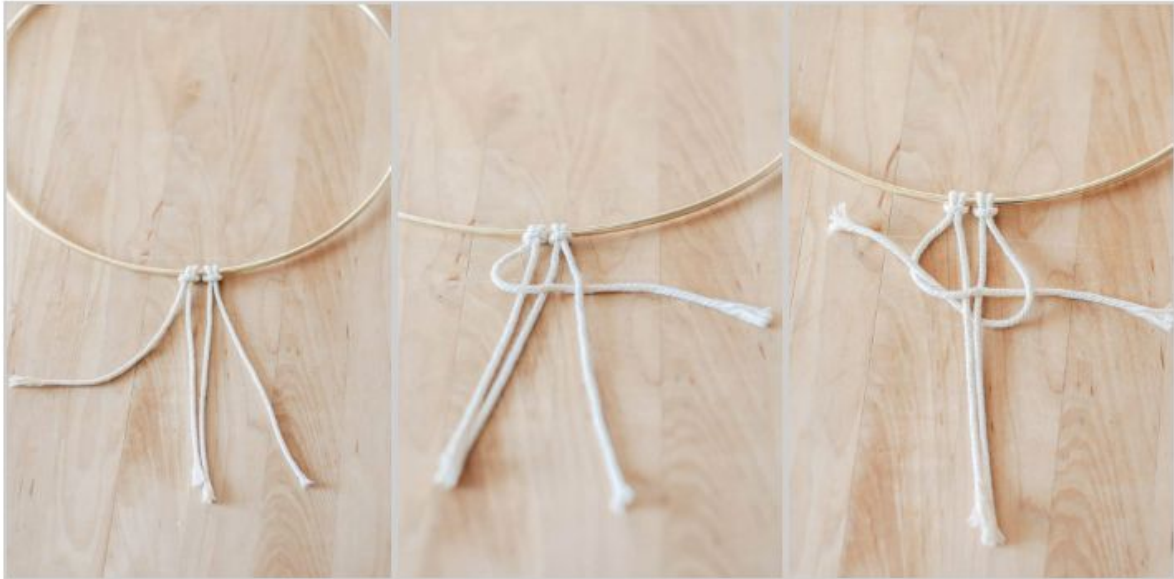
2 Lark's Head Knots