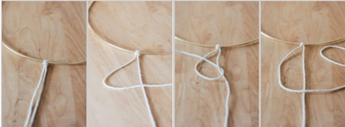
Start with Lark's Head Knot